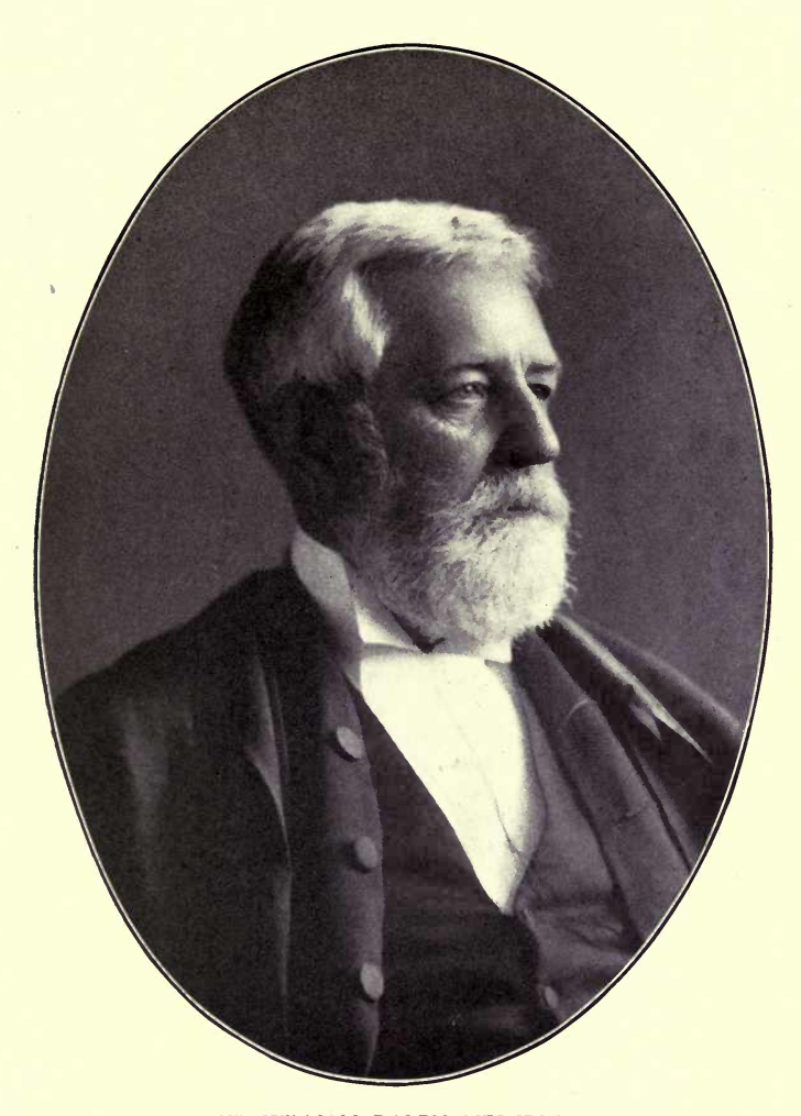
SIR WILLIAM RALPH MEREDITH, Chief Justice High Court of Ontario, previously Leader of Conservative Opposition.