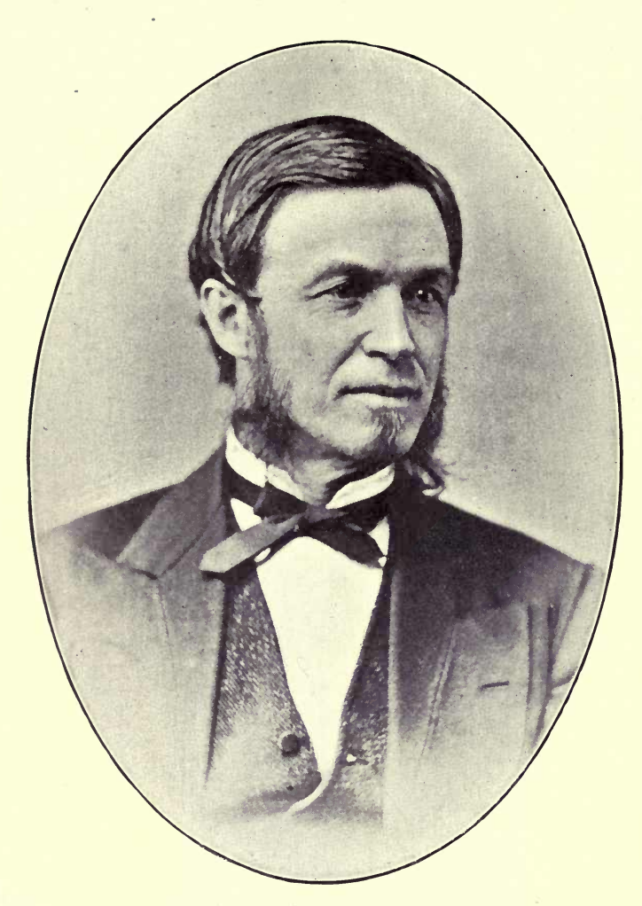
HON, MATTHEW CROOKS CAMERON, First Leader of the Ontario Conservative Opposition.